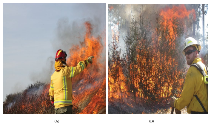
Figure 2: Prescribed burning in sea buckthorn (A) and yaupon (B).